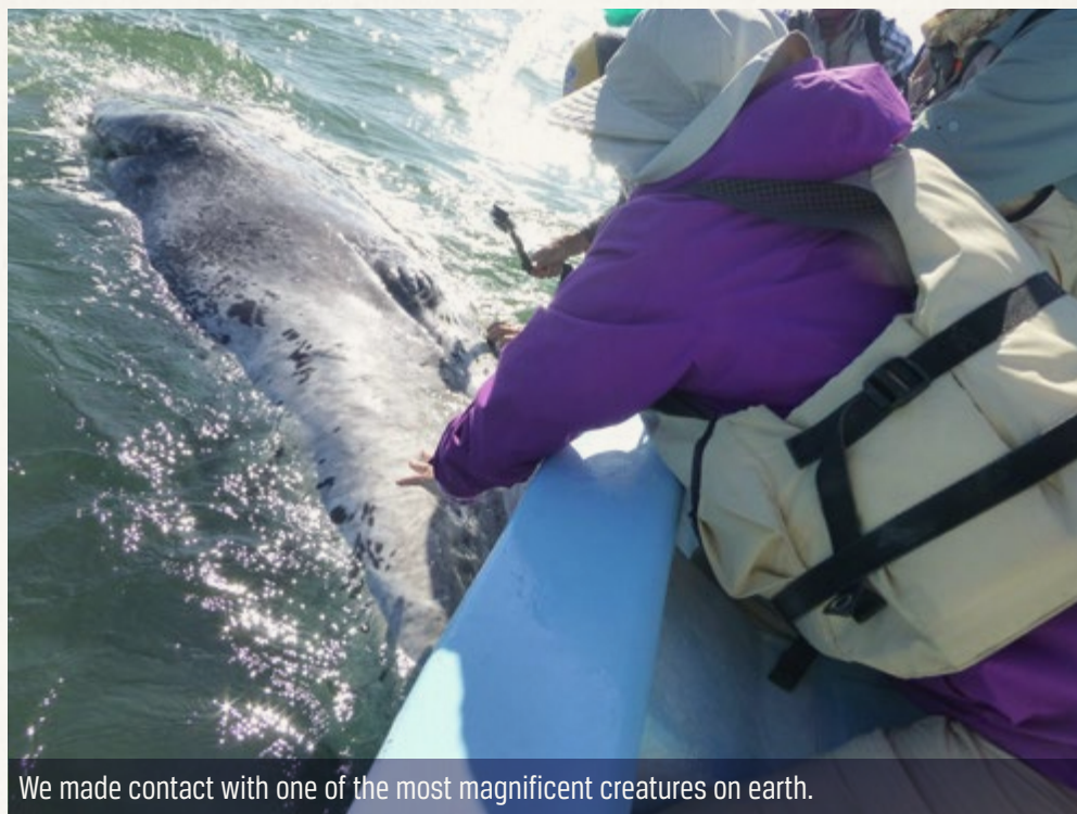
We made contact with one of the most magnificent creatures on earth.

Explore Tucson's short-lived attempt to build a grand city in the dusty spaces once occupied by Camp Lowell.