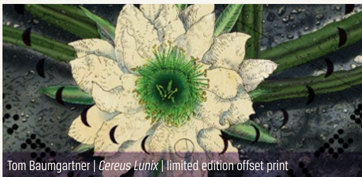
Tom Baumgartner | Cereus Lunix | limited edition offset print