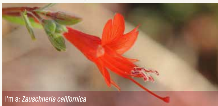
l'm a: Zauschneria californica