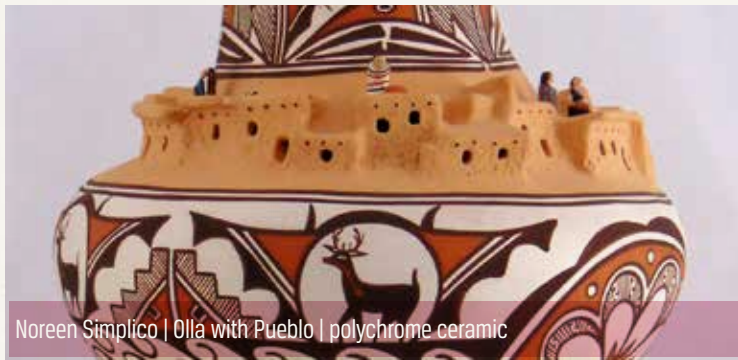
Noreen Simplico | Olla with Pueblo | polychrome ceramic