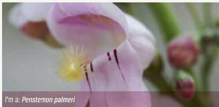
l'm a: Penstemon palmeri