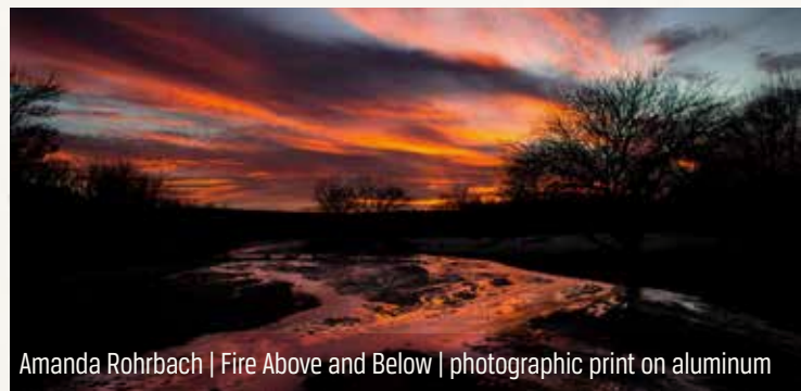
Amanda Rohrbach | Fire Above and Below | photographic print on aluminum