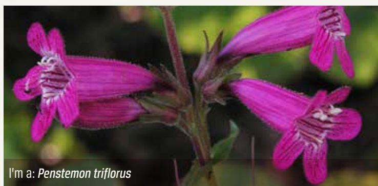
l'm a: Penstemon triflorus