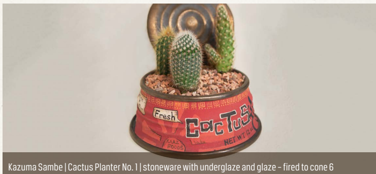
Kazuma Sambe | Cactus Planter No. 1 | stoneware with underglaze and glaze - fired to cone 6