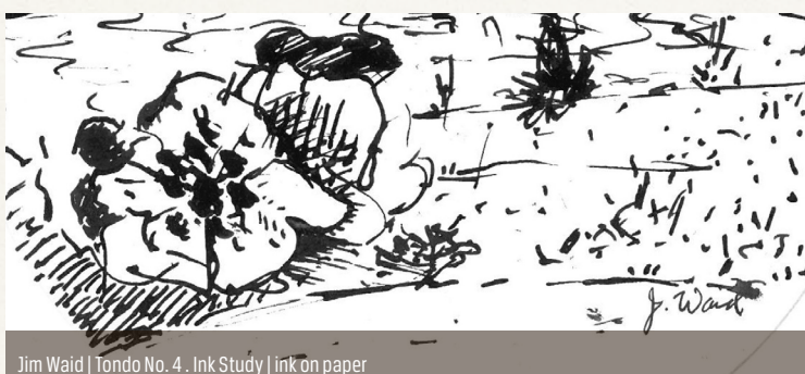
Jim Waid | Tondo No. 4 - Ink Study | ink on paper