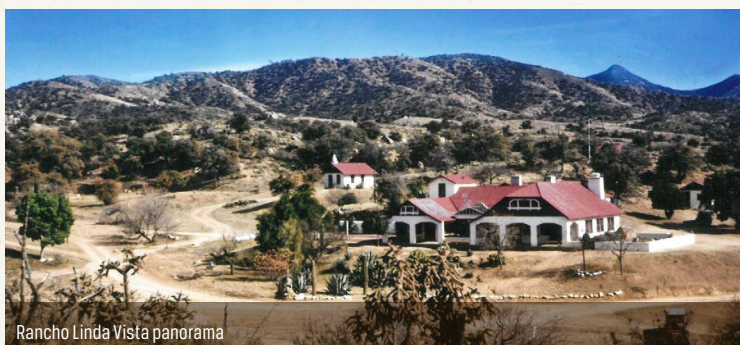
Rancho Linda Vista panorama