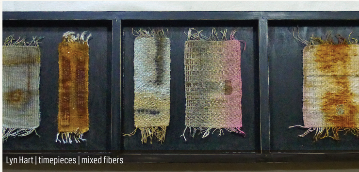
Lyn Hart | timepieces | mixed fibers