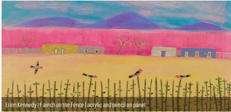
Erinn Kennedy | F ainch on the Fence | acrylic and pencil on panel

Follows the many directions pollen flows through the world – in the air and on the bodies of pollinators in the accidental acts of self-pollination and cross pollination.