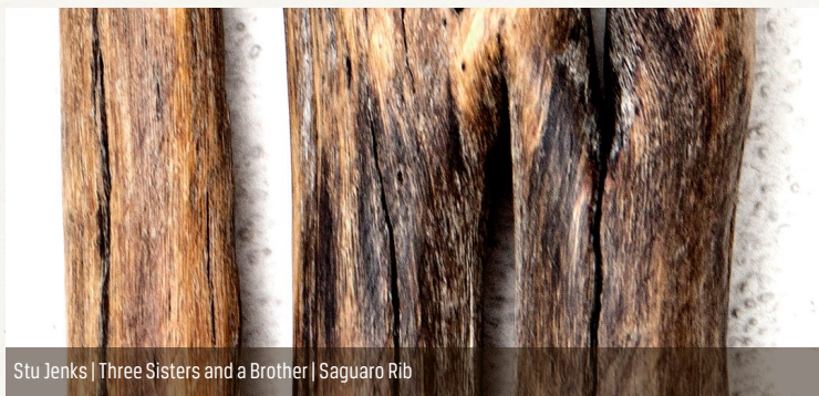
Stu Jenks | Three Sisters and a Brother | Saguaro Rib

The Entry Gallery Project Space offers Arizona artists an intimate space for cohesive projects. Ros and Kennedy conduct a colorful dialog that unites their seemingly disparate works; Windsor and Windsor present the inner beauty of desert woods in turned wood and fabric abstractions; Swangstu employs thin strips of hand-dyed cotton fabric in moody textile collages.