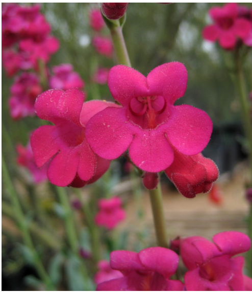
Red Headed Beauty