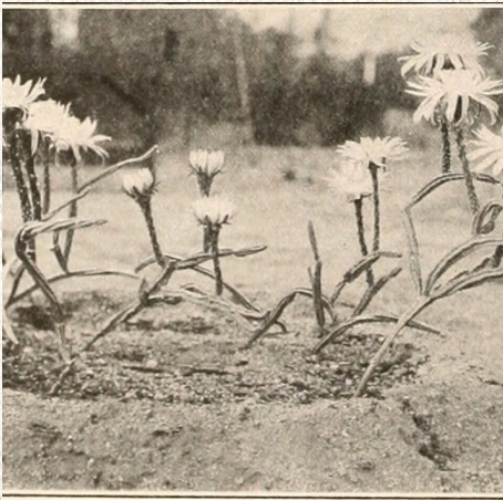
FIG. 166.— Peniocereus greggii .