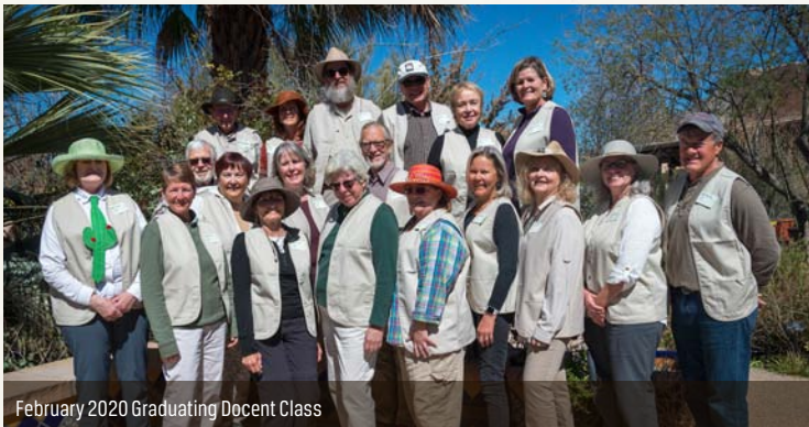
February 2020 Graduating Docent Class

Docents, of all levels, focus on topics such as Ensuring a Positive Guest Experience; Inclusion and Accessibility; Principles of Interpretation; Birds, Butterflies, Succulents, Shrubs, Trees, Flowering Plants, and Vines; Connecting Plants and People (Ethnobotany); Desert Landscaping; and Tohono Chul Gardens.