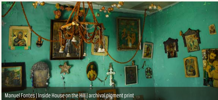
Manuel Fontes | Inside House on the Hill | archival pigment print