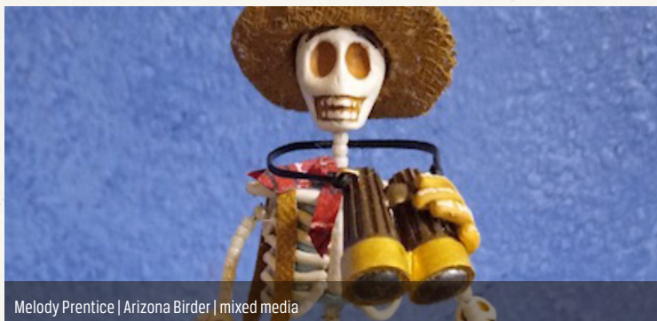
Melody Prentice | Arizona Birder | mixed media