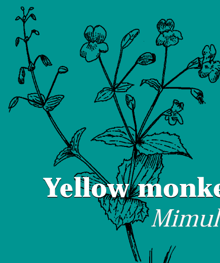
Yellow monkey flower Mimulus guttatus