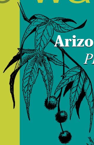
Arizona sycamore Platanus wrightii

See if you can find the following plant species—look for tree shapes, leaf patterns, and distinctive flowers and fruits to test your naturalist skills, then check the ID sign at the base of each plant to see if you are right!