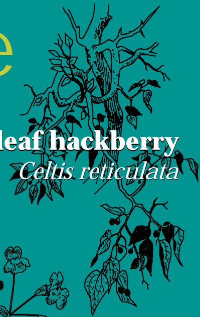
Netleaf hackberry Celtis reticulata