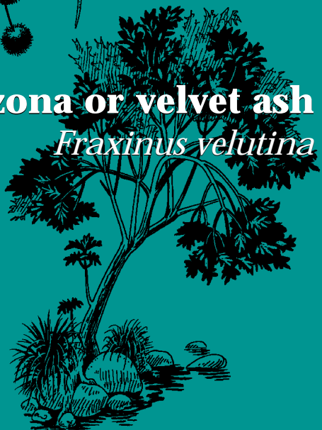
Arizona or velvet ash Fraxinus velutina