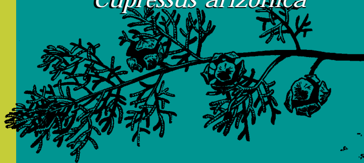
Arizona cypress Cupressus arizonica