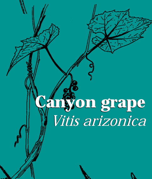
Canyon grape Vitis arizonica