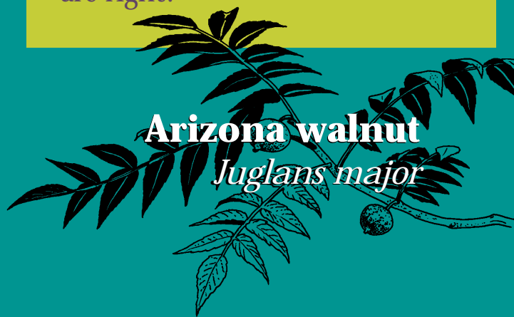
Arizona walnut Juglans major