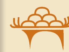
billowing cloudbank symbolizes rain for Rio Grande pueblos